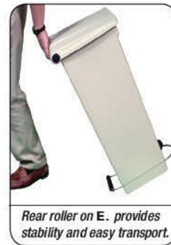
Rear roller on E. provides stability and easy transport.