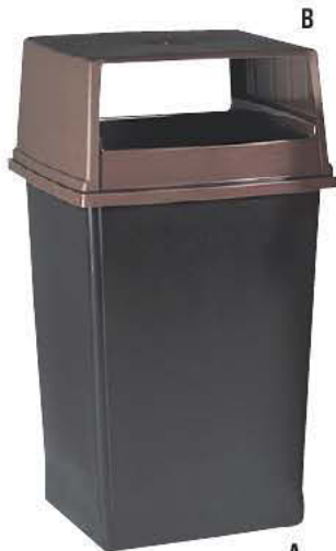
Container and top sold separately.