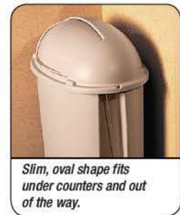
Slim, oval shape fits under counters and out of the way.