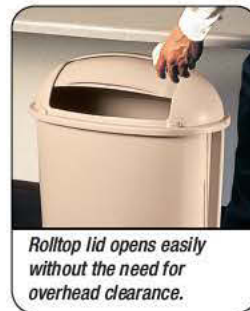
Rolltop lid opens easily without the need for overhead clearance.