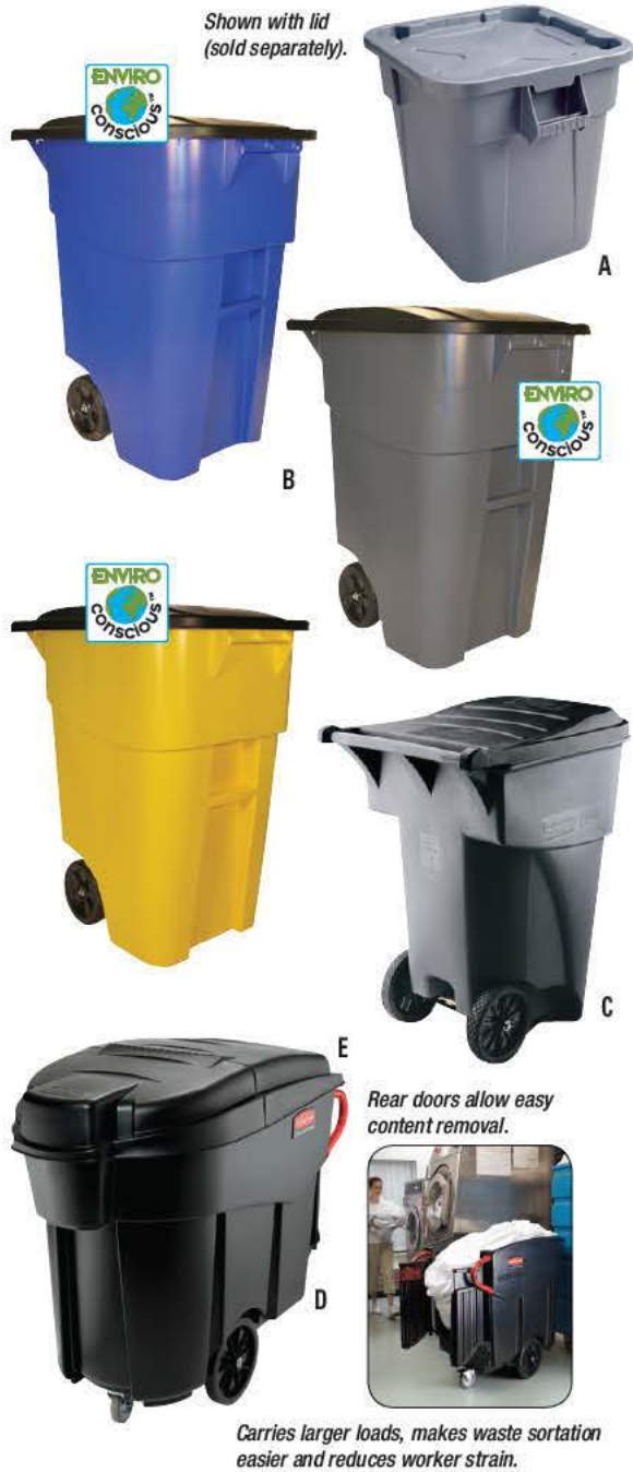
Shown with lid (sold separately).